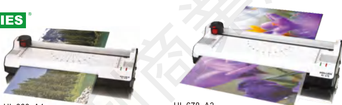
HL 668, A4