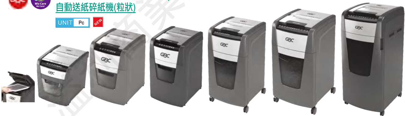
ShredMaster 50X ShredMaster 100X ShredMaster150M ShredMaster 225M ShredMaster 300M ShredMaster 600M