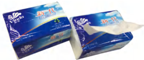
Vinda Pack 維達包裝