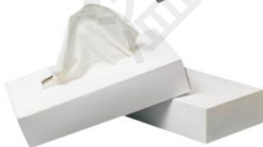
White box 白盒