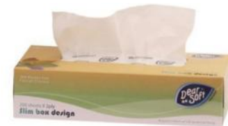
Dear Soft 親柔