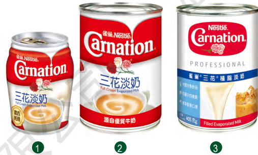
1 2 3