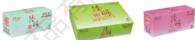
9 10 11