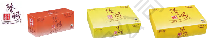
6 7 8